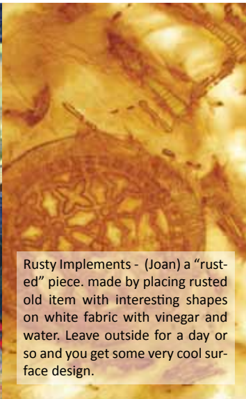
Rusty Implements - (Joan) a "rust-ed" piece. made by placing rusted old item with interesting shapes on white fabric with vinegar and water. Leave outside for a day or so and you get some very cool surface design.